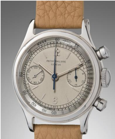
Patek Philippe 'Tasti Tondi' Chronograph, Ref. 1463 A very rare and well preserved stainless steel chronograph wristwatch with two-tone dial, circa 1946 Estimate: $300,000 to $500,000