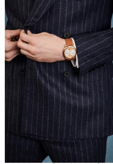
MR PORTER's Business Look