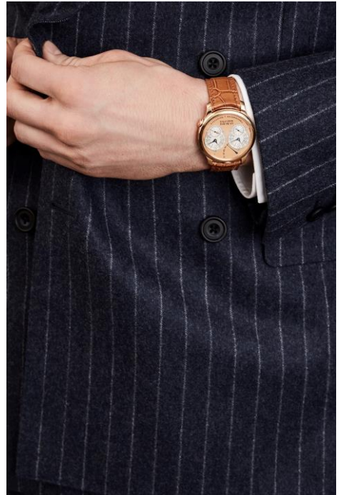
MR PORTER's Business Look

5 December Watch Auction to Feature Exceptional Vintage and Modern Timepieces, Matched with Essentials of Men's Style