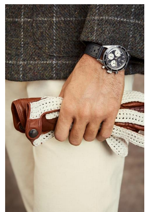
THE RAKE's Goodwood Look