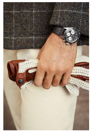
THE RAKE's Goodwood Look