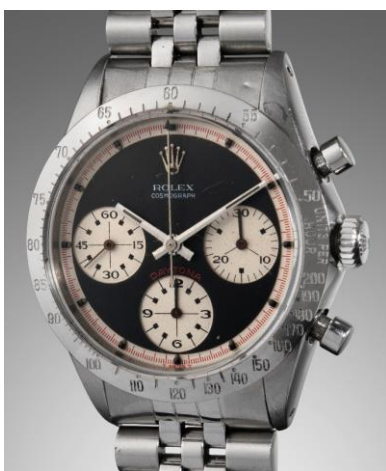
Rolex Cosmograph Daytona, Ref. 6239 A historically important Paul Newman Daytona awarded to the winner of the 1969 Daytona 500, circa 1967 Estimate: $150,000 to $300,000