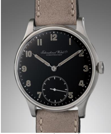
IWC Portugieser, Ref. 325 A rare, exceptionally well-preserved, and oversized stainless steel wristwatch with black lacquered dial and luminous numerals, circa 1942 Estimate: $80,000 to $120,000