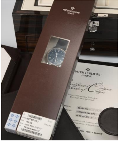
Patek Philippe, Ref. 5078P-013 A possibly unique, platinum, selfwinding minute repeating wristwatch with blue 'soleil' dial with boxes, papers, and certificate, circa 2009 Estimate: $250,000 to $500,000