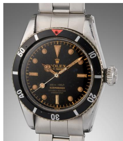
Rolex 'Big Crown' Submariner, Ref. 6538 An extremely rare stainless steel wristwatch with "four liner" glossy dial, original box, guarantee, and chronometer certificate, circa 1957 Estimate: $300,000-600,000

With watches ranging in price from $4,000, and some offered without reserve, highlights of the exceptional watches to be auctioned include: