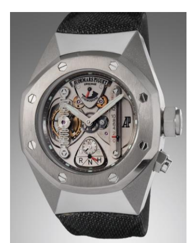
Audemars Piguet Royal Oak Concept, Ref. CW1. An exceptional and very rare limited edition wristwatch with tourbillon and dynamographe, circa 2004 Estimate: $90,000 to $120,000